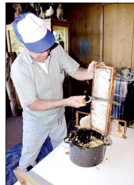
Harvesting honey