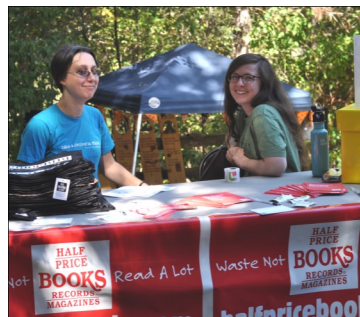
2012 sponsor Half Price Books