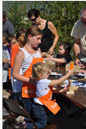
Home Depot Kids Workshop