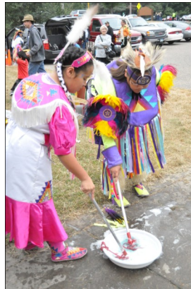
Dancers take time out to make bubbles